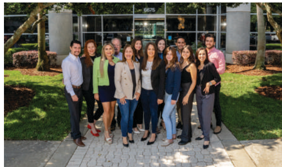
Purposeful brand & team